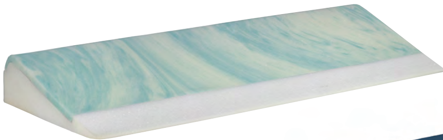
Bare Foam Disposable Version