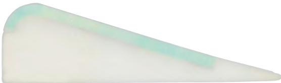
Profile view of firm core and VE top layer