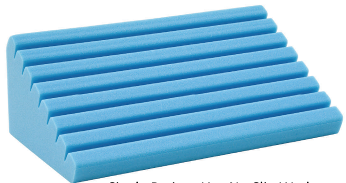
Single Patient Use No-Slip Wedge

Phone: 866.736.8484 Fax: 941.359.6939 www.heelzup.com